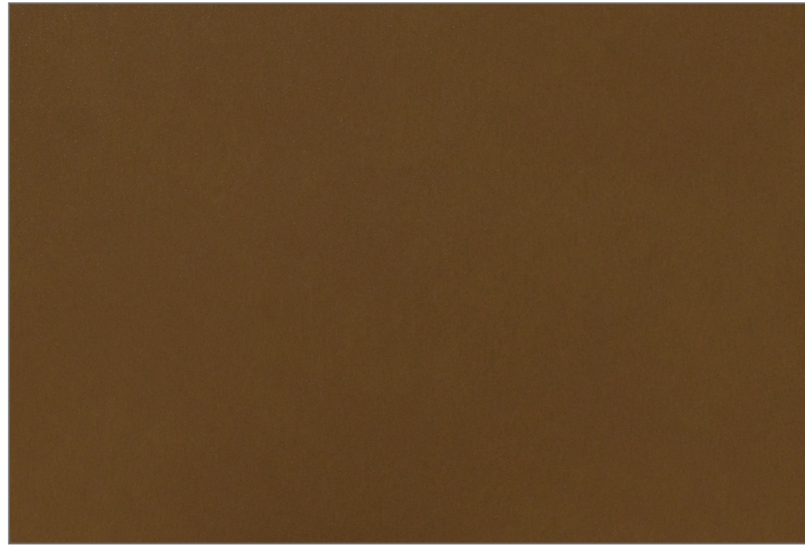
SSE023 Single Malt