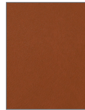
SSE020 Pumpkin Pie