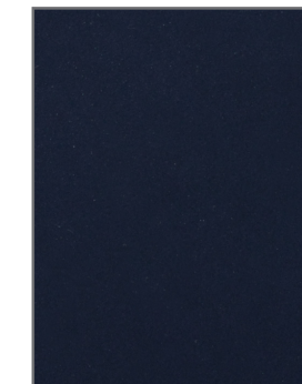
SSE015 Night Sky